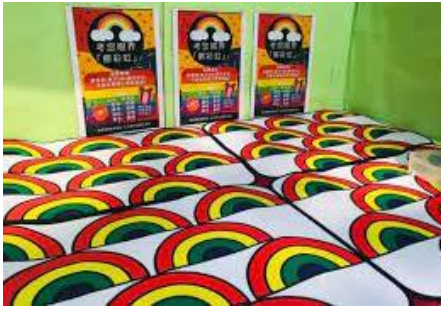
Figure 1 (“Happy Rainbow Game”)

In the “Happy Rainbow Game” (Figure 1), players throw coins onto a game board. Prizes will be awarded according to where the coins land on. Instead of the “Happy Rainbow Game”, we consider the traditional coin throwing game (Figure 2), in which coins are to be thrown onto a game board with square tiles.