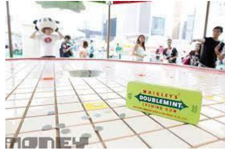
Figure 2 (Coin Throwing Game)

To win the coin throwing game, coins have to land entirely inside the square tiles without touching the borders. Figure 3 and Figure 4 illustrate a winning situation and a losing situation respectively.