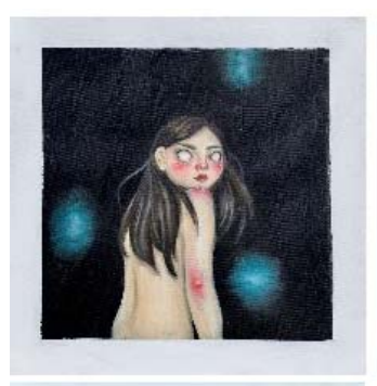
Artwork 1 Fearness Oil on canvas 30 x 30, 40 x 40, 50 x 50 & 60 x 60 cm