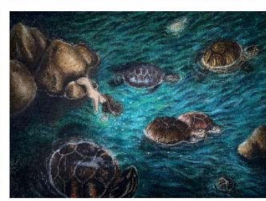
Artwork 4 Greed Animation 1 min 28 sec