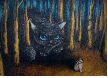
Artwork 2 Confusion Soft pastel on raw board 42 x 29.7 cm (4 pieces)